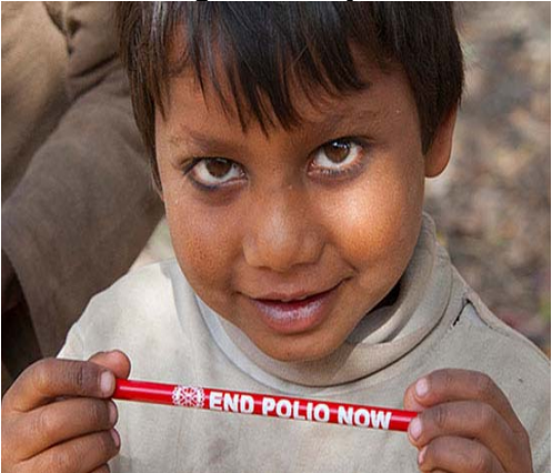
Photo: Our regular contributions all help to End Polio Now

These new outbreaks may delay the recently announced $5.5 billion plan to eradicate polio by 2018.